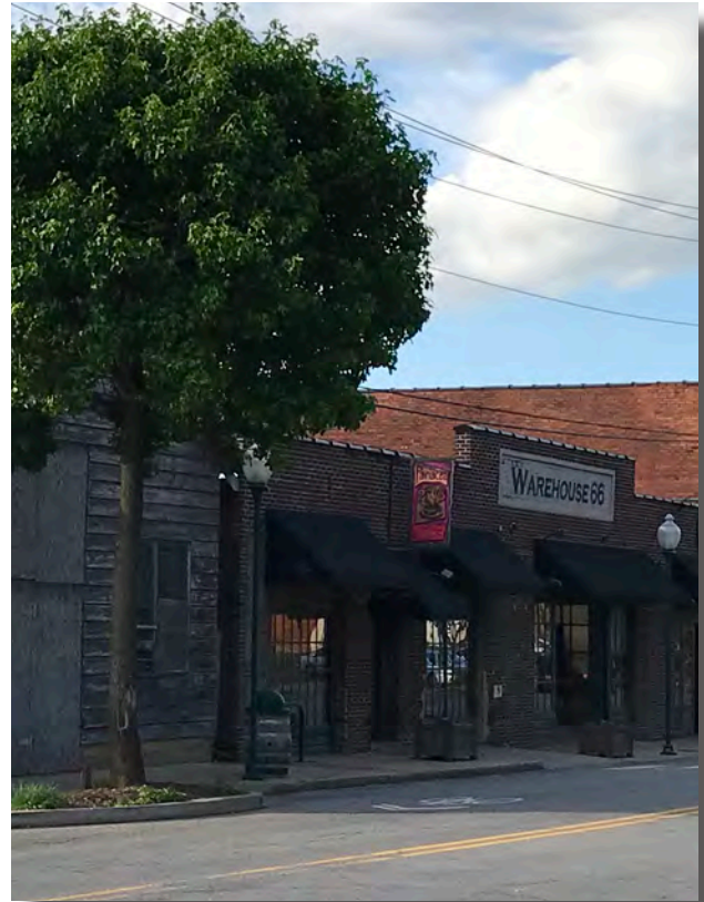
Historic Frog Level District