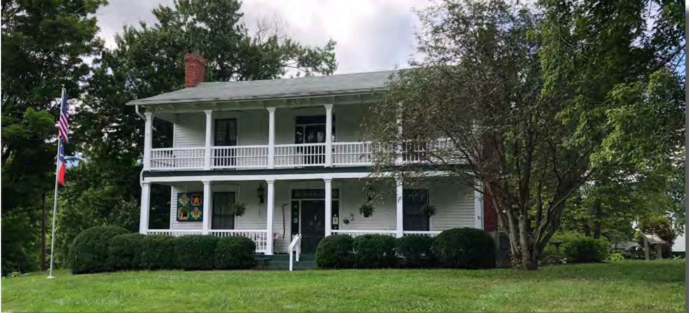
Historic Shelton House